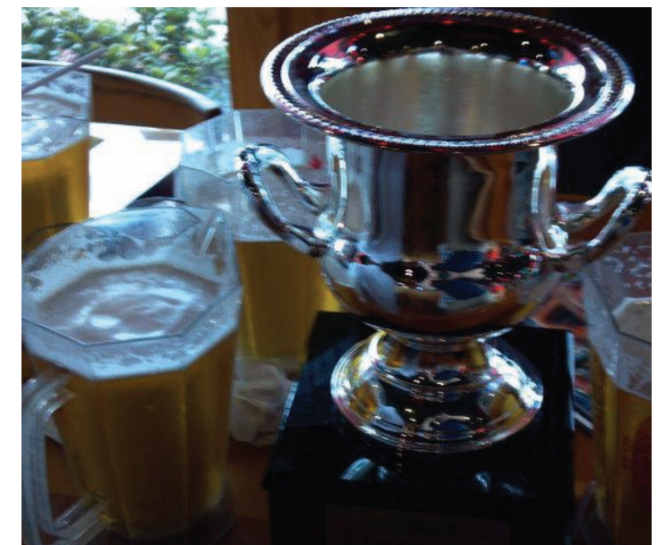
The championship toast - Golden Ale, Golden Cup.