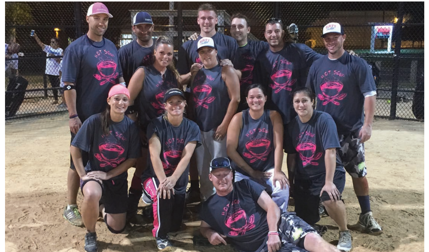
Hot Soup - 37th Annual Hampton's Classic Coed Division Champions